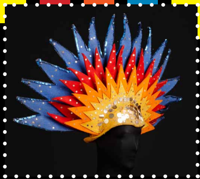
Headdress worn by Reg Livermore as Wonder Woman, 1976–77 Gift of Reg Livermore, AO, 2006 The Arts Centre, Performing Arts Collection